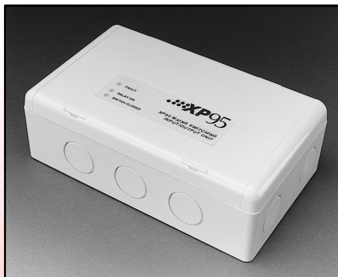
Part no 55000-875

When output bit 0 is set to logic 1 on two or more consecutive pollings, the relay changes state to the "set" condition. Bit 0 must be set to logic 1 as long as it is desired to keep the relay in its set state. The relay will remain latched in the set state until output bit 0 is set to logic 0 on two or more consecutive pollings. Neither the removal of loop power nor the discontinuation of interrogation of its address will affect the state – set or not – of the relay.