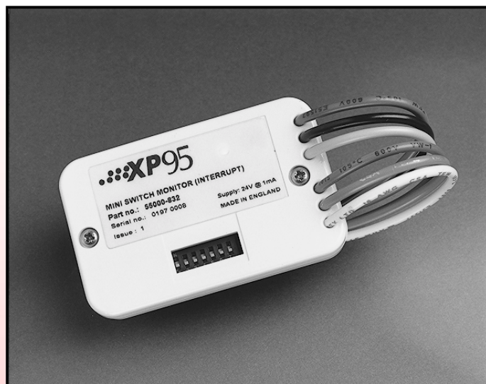
Part no: 55000-832

The control equipment transmits a 10-bit message to the Mini Switch Monitor (Interrupt):